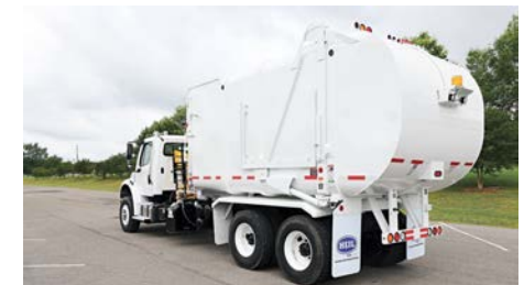
OPTIMIZED WEIGHT BODY

Select-O-Pack allows an operator to set a predetermined number of lift cycles before the auto-pack sequence is engaged. This feature simplifies operation and helps extend the life of the paddle packer. Combine the optional Extended Tailgate Seal with the Select-O-Pack feature, and you will have the optimal ASL for your organic collection.