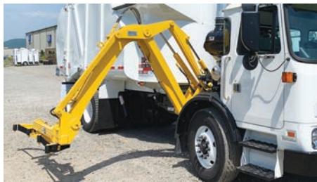
PYTHON AUTOMATED LIFT

Eight-second lift cycle can save up to four seconds per stop - up to one hour per day. This can add up to more than $15,000 in savings per truck, per year! The Python lift arm's 9' reach can slither between cars and other obstacles, making even the most difficult pick-ups possible.