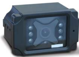
AWT2020T HD Color Camera