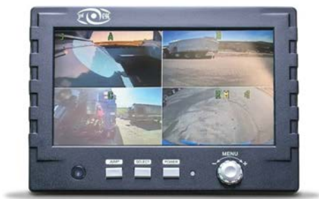
3EC07MLEDT 7" HD LCD Monitor