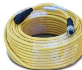
AWT010TT Camera Cable

3EC07MLEDT Monitor - Our most popular viewing monitor is the 7" HD LCD viewing monitor. The 7" viewing monitor can simultaneously display up to 4 camera views. It can automatically trigger a desired view, such as reverse. When selected as the trigger, placing the vehicle in reverse will automatically trigger the reverse view on the display. Nothing is required from the operator to activate the camera view automatically.