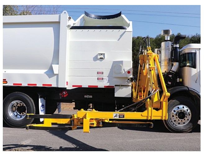
The Parts Central Fen-X Remanufactured Python arm replacement program provides unbeatable value and reliability.