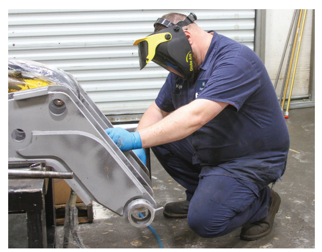
Arms are completely disassembled and thoroughly sandblasted to bare metal prior to inspection.

The most cost-effective program to provide affordable, reliable Genuine Heil OEM parts for your refuse equipment. Don't cut quality, cut costs!