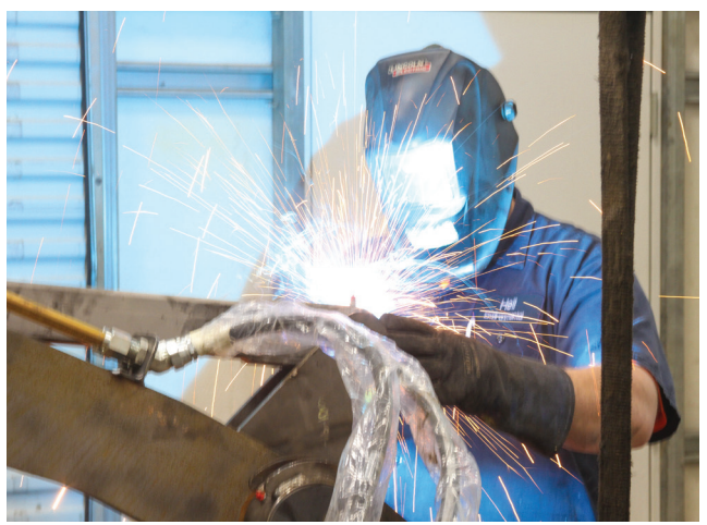
Weldments, cylinders, and valves are reconstructed and tested by Heil® certified technicians to ensure that OEM specs are met.