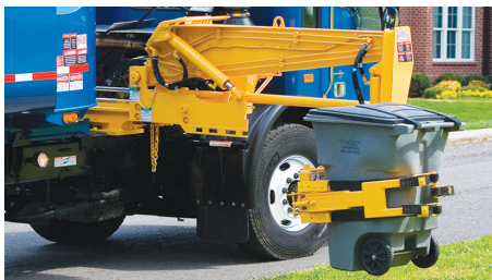
RAPID RAIL AUTOMATED LIFT

The Rapid Rail automated lift arm can efficiently handle containers from 30 gallons up to 300 gallons, making it an ideal solution for commercial and residential applications. The redesigned lift features a six-roller carriage that distributes the load evenly across the arm, greatly increasing its life.