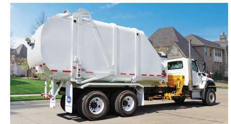
OPTIMIZED WEIGHT BODY

Select-O-Pack allows an operator to set a predetermined number of lift cycles before the auto-pack sequence is engaged. This feature helps to extend the life of the paddle packer.