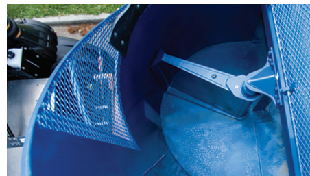
BIG SWING PADDLE PACKER

The Rapid Rail automated lift arm can efficiently handle containers from 30 gallons up to 300 gallons, making it an ideal solution for commercial and residential applications. The redesigned lift features a six-roller carriage that distributes the load evenly across the arm, greatly increasing its life.