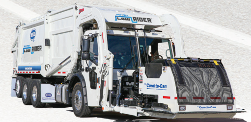
Optional Curotto-Can® Residential Package