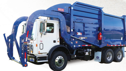
Available in 20 yard body configuration